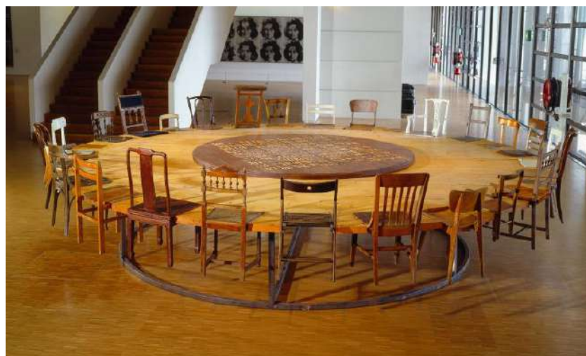
Round Table by CHEN Zhen, 1995